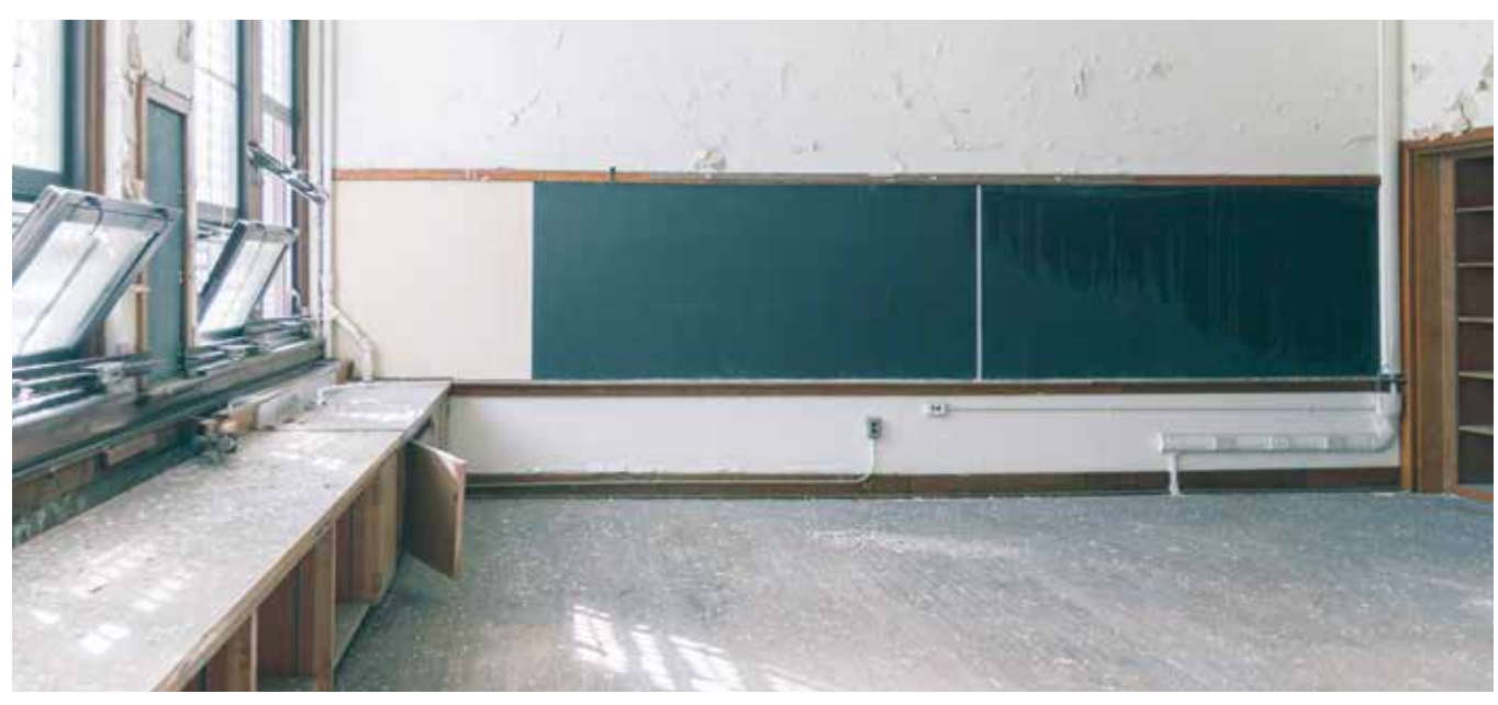
The old school building Detroit Prep hopes to move in to has been abandoned and empty since 2009.

In other words, the district wants to take taxpayer dollars from the state but retain the authority to discriminate against other public schools and their students. That approach may serve the interest of the district, but not the people of Michigan or the schoolchildren of Detroit.