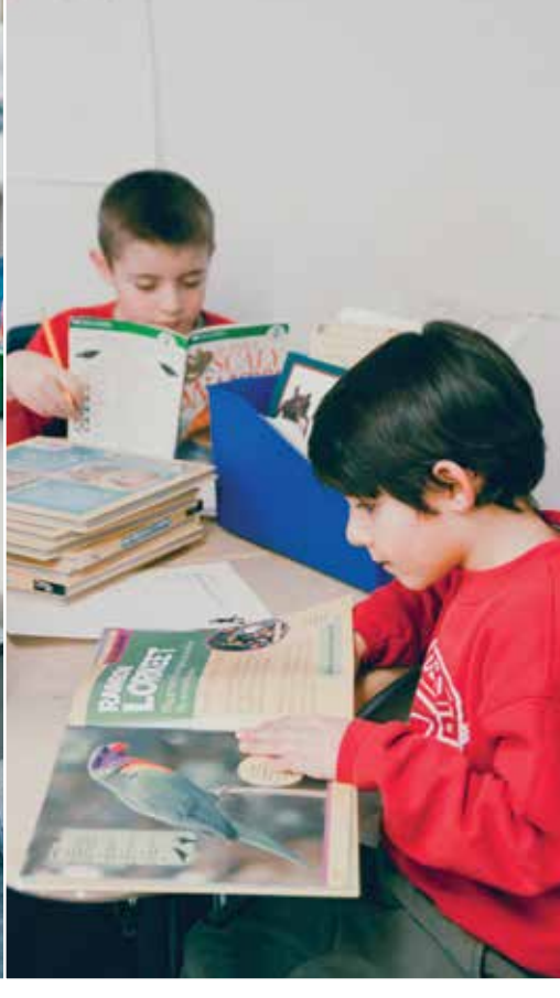
Detroit Prep currently offers kindergarten through second grade.

property. Still, the district would not budge.