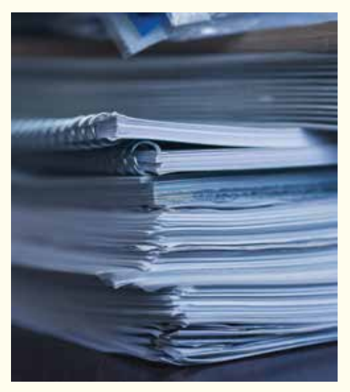
The state took four months to complete our request for information