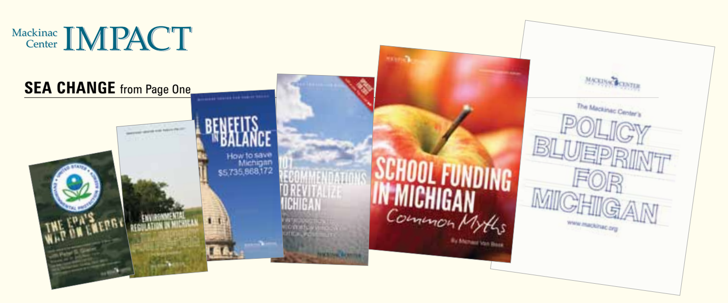
The Mackinac Center's "Policy Blueprint for Michigan" packet distributed to legislators included an invitation to an Issues & Ideas forum on the EPA's War on Energy (www.mackinac.org/14379), "Environmental Regulation in Michigan" (http://www.mackinac.org/13789), "Benefits in Balance" (www.BenefitsinBalance.com), "101 Recommendations to Revitalized Michigan" (www.mackinac.org/10154) and "School Funding in Michigan: Common Myths" (www.mackinac.org/12610).

interviews with a number of legislators, capturing their priorities and views on key issues. Highlights were featured in a video for the Michigan Capitol Confidential website.