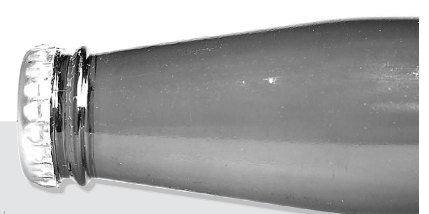
OTHER RECIPIENTS. Some metro Detroit legislators did not have fund-raisers paid for by the PAC. But they weren't left out — they also received contributions.