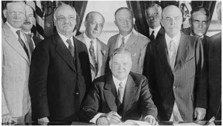
PRESIDENT HERBERT HOOVER is mistakenly presented in standard history texts as a laissez-faire president, but he signed into law so many costly and foolish bills that one of Franklin Roosevelt’s top aides later said that “practically the whole New Deal was extrapolated from programs that Hoover started.”

Did Hoover really subscribe to a “hands-off-the-economy,”