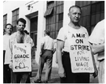
SPECIAL POWERS GRANTED to organized labor with the passage of the Wagner Act contributed to a wave of militant strikes and a “depression within a depression” in 1937.

Mencken excelled himself in attacking the triumphant FDR, whose whiff of fraudulent collectivism filled him with genuine disgust. He was the ‘Führer,’ the ‘Quack,’ surrounded by ‘an astonishing