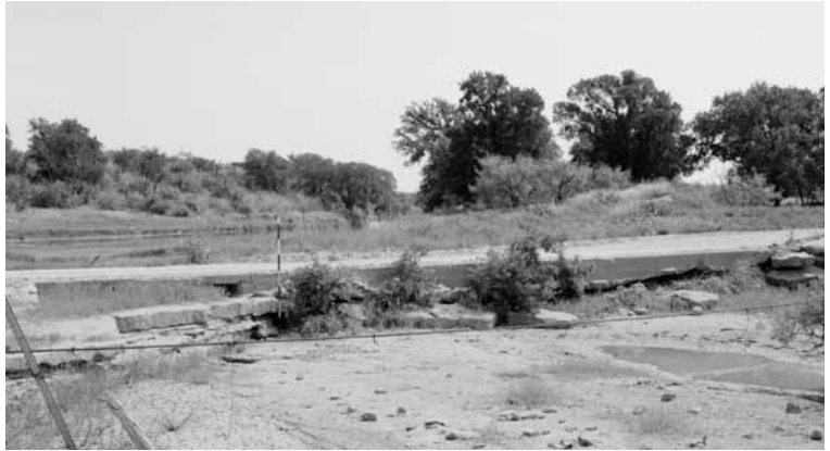
THIS 1989 PHOTO is of a bridge built from 1936-41 as part of a Works Progress Administration (WPA) project in Coleman County, Texas. Many Americans saw such projects as helpful, without considering their high cost and the corruption that plagued the program.

Crisis gripped the banking system when the new president assumed office on March 4, 1933. Roosevelt's action to close the banks and declare a nationwide