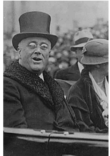
PRESIDENT FRANKLIN ROOSEVELT decried as selfish “economic royalists” those businessmen who opposed the burdensome taxes and regulations of his “New Deal.”

In September 1931, with the money supply tumbling and the economy reeling from the impact of Smoot-Hawley, the Fed imposed the biggest hike in its discount rate in history. Bank deposits fell 15 percent within four months and sizable, deflationary declines in the nation’s money supply persisted through the first half of 1932.