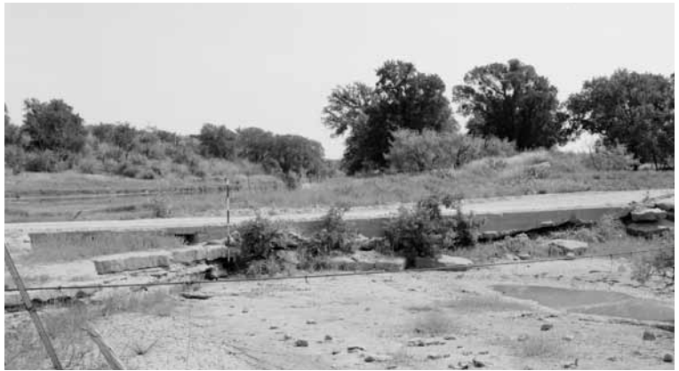
THIS 1989 PHOTO is of a bridge built from 1936-41 as part of a Works Progress Administration (WPA) project in Coleman County, Texas. Many Americans saw such projects as helpful, without considering their high cost and the corruption that plagued the program.

Crisis gripped the banking system when the new president assumed office on March 4, 1933. Roosevelt's action to close the banks and declare a nationwide