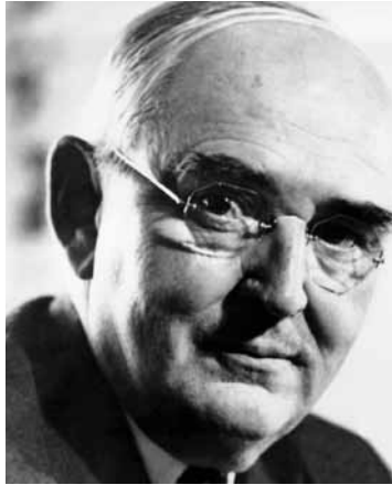
MICHIGAN SENATOR Arthur Vandenberg argued that a sound economy could not be restored through FDR’s punitive tax and regulatory measures.

Though he seized the country’s gold, Roosevelt did return booze to America’s bars and parlor rooms. On his second Sunday in the White House, he remarked at dinner, “I think this would be a good time for beer.” 23 That same night, he drafted a