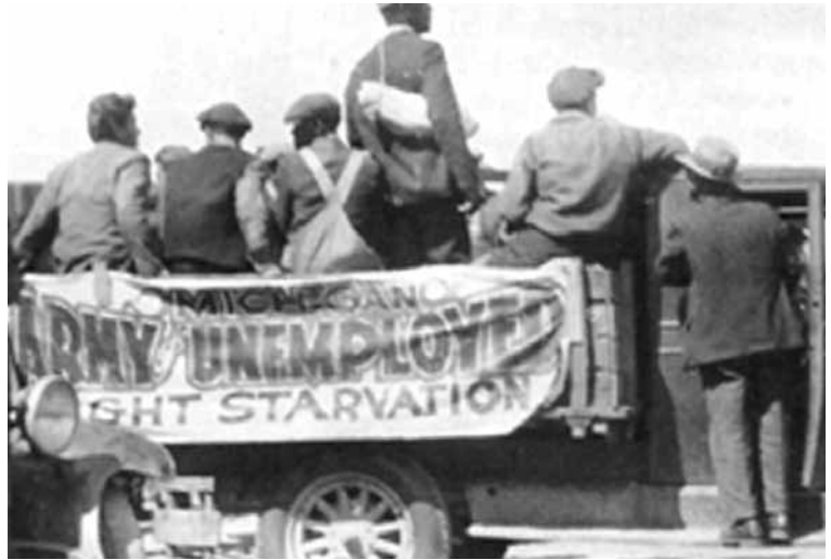
UNEMPLOYMENT SKYROCKETED after Congress raised tariffs and taxes in the early 1930s and stayed high as policies of the Roosevelt administration discouraged investment and recovery during the rest of the decade.

Substantial cuts in high marginal income tax rates in the Coolidge years certainly helped the economy and may have ameliorated the price effect of Fed policy. Tax reductions spurred investment and real economic growth, which in turn yielded a burst of technological advancement and entrepreneurial discoveries of cheaper ways to produce goods. This explosion in productivity undoubtedly helped to keep