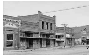
THE GREAT DEPRESSION devastated every part of America, even its smallest towns.

According to this simplistic perspective, an important pillar