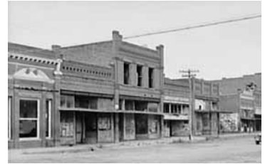
THE GREAT DEPRESSION devastated every part of America, even its smallest towns.

According to this simplistic perspective, an important pillar