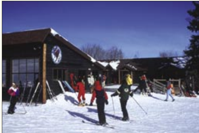
Private management has taken this ski slope from pork to rubber ducks. The result is a $200,000 savings for taxpayers. The Mackinac Center was alone in its public recommendation that the ski area be privatized.

Ducky Challenge,” which paid $5,000 to the skier who found the most rubber ducks planted throughout the ski area. They also held a $99 sale for season passes (a 60 percent drop in price) and made the passes transferable to Mt. Bohemia. This led to a 12-fold increase in season pass sales. Daily fees to skiers remained unchanged at $28.