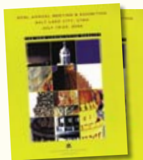
Tuition tax credits were part of the agenda at the National Conference of State Legislatures.

“I want to thank you for all you’ve done for our nation’s children. The Mackinac Center and institutions like it have helped blaze a trail of education reform in Michigan and across the nation.”