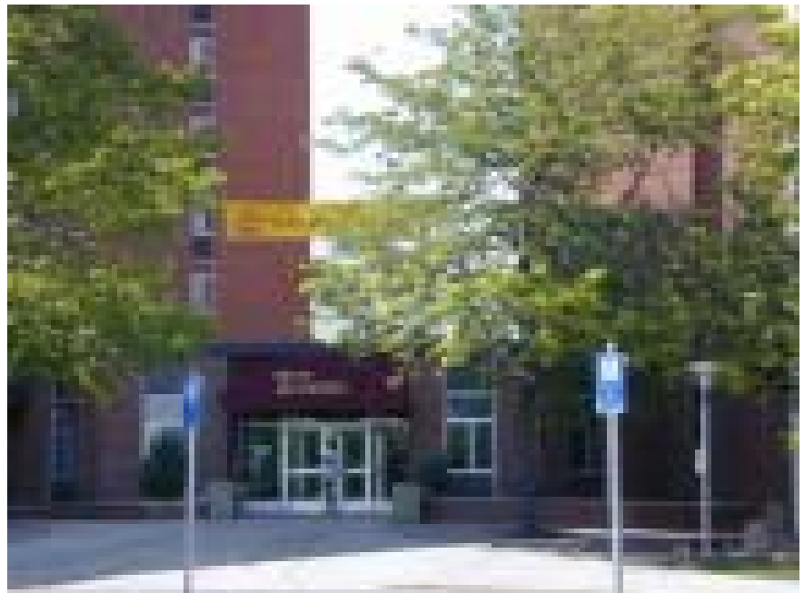
"The Towers" at Central Michigan University look and feel like a multi-building hotel. Why not have a hotel chain own and manage them?

money by contracting with private companies, such as Aramark, Gordon Food Service, or the Pepsi Cola Company, etc. Central Michigan University (CMU), for example, steadily lost money on its retail food services until it contracted in part with Aramark in 1994. Between