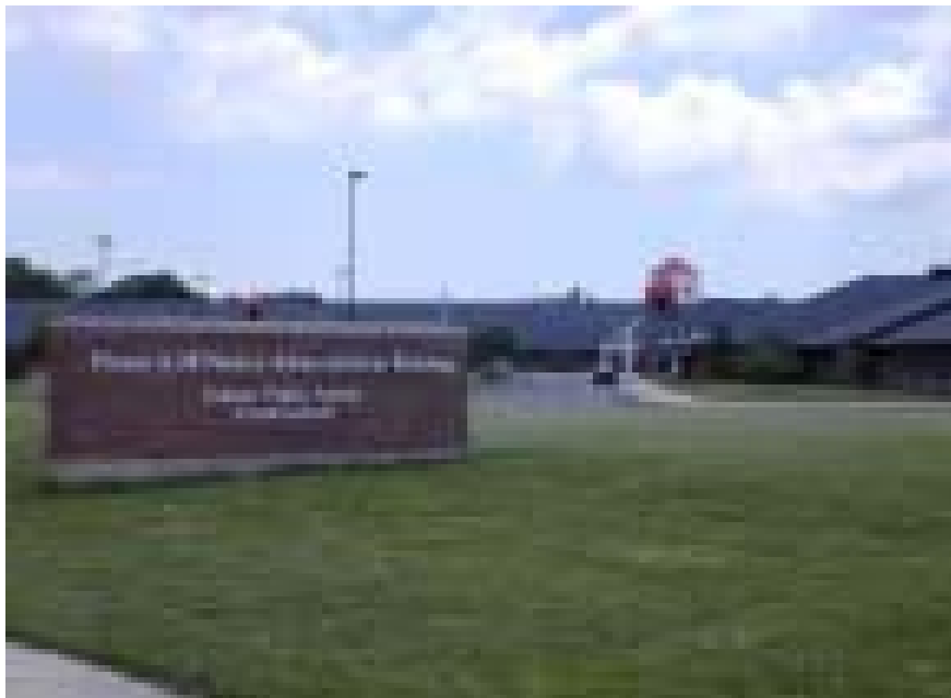
This new, well-maintained building houses the administration services and elementary school for the Inkster school district.

use to evaluate Edison. Other measures of achievement outlined in the agreement include increased student enrollment; greater parent, teacher, and student satisfaction; more family and community involvement; and better attendance.