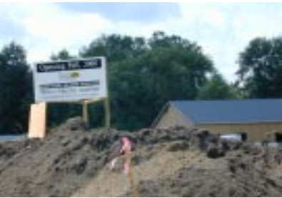
This National Heritage Academy charter school under construction, promises quality education to students in Romulus.