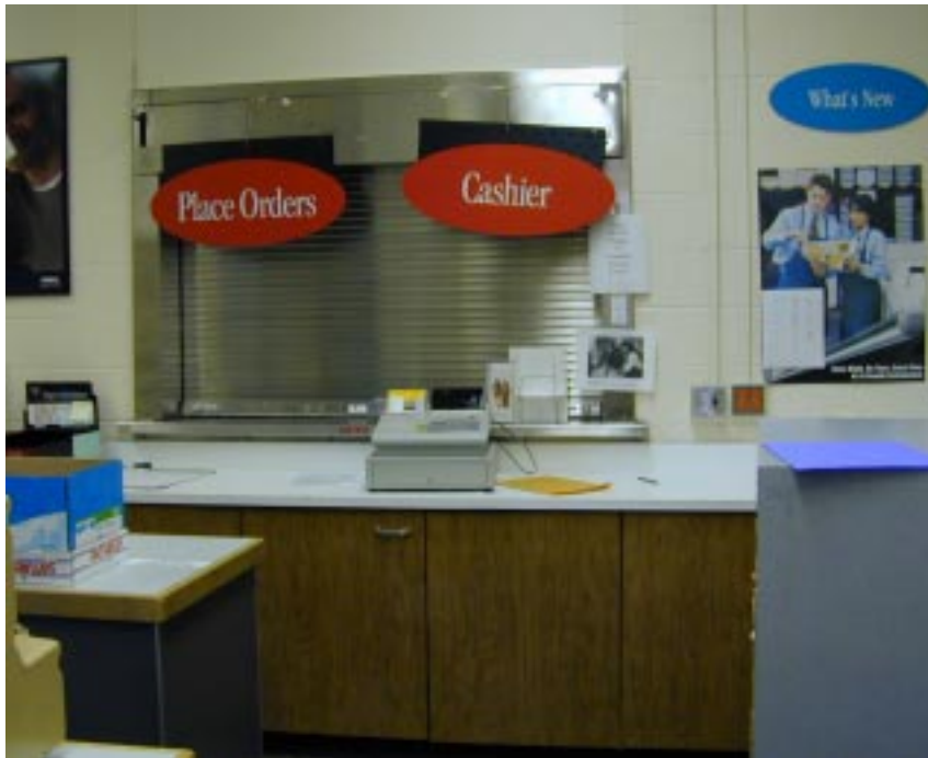
Kinko's and Southfield High school hit two birds with one stone. The student-vcmanged mini-Kinko's store in Southfield High teaches kids about business and fulfills office needs for the district.