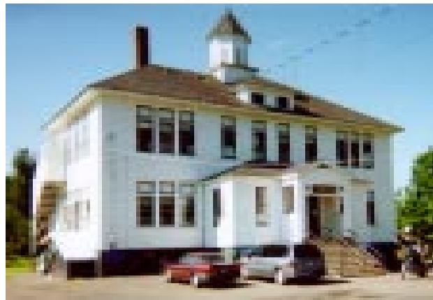
Despite only having 13 students enrolled, the single-building Arvon Township school district is saddled with heavy administrative costs. School board members are embracing—over union objections—privatization as a way to avoid financial disaster.