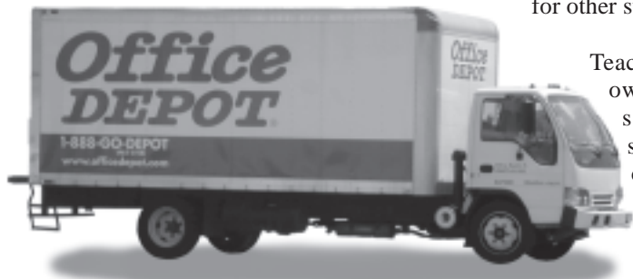
Office Depot trucks will deliver school supplies to Detroit Public Schools on demand thanks to a new privatization initiative. The program will put to rest the grossly inefficient warehousing system previously used by the district.

Stocking classrooms and offices with pens, pencils, notepads, and other supplies just became easier—and cheaper—for Detroit public schools.