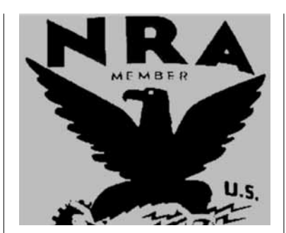
TO MANY AMERICANS, the National Recovery Administration's bureaucracy and mind-numbing regulations became known as the "National Run Around."

Franklin Delano Roosevelt won the 1932 presidential election in a landslide, collecting 472 electoral votes to just 59 for the incumbent Herbert Hoover. The platform of the Democratic Party, whose ticket Roosevelt headed, declared, "We believe that a party platform is a covenant with the people to be faithfully kept by the party entrusted with power." It called for a 25 percent reduction in federal spending, a balanced federal