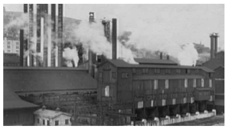
AT THE NADIR of the Great Depression, half of American industrial production was idle as the economy reeled under the weight of endless and destructive policies from both Republicans and Democrats in Washington.

The economic impact of the NRA was immediate and powerful. In the five months leading up to the act's passage, signs of recovery were evident: factory employment and payrolls had increased by 23 percent and 35 percent, respectively. Then came the NRA, shortening hours of work, raising wages arbitrarily and imposing other new costs on enterprise. In the six months after