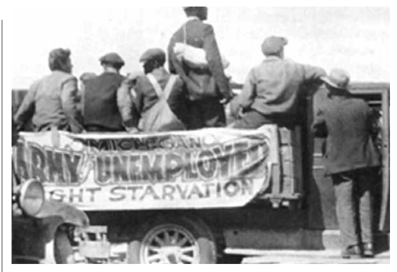
UNEMPLOYMENT SKYROCKETED after Congress raised tariffs and taxes in the early 1930s and stayed high as policies of the Roosevelt administration discouraged investment and recovery during the rest of the decade.

Substantial cuts in high marginal income tax rates in the Coolidge years certainly helped the economy and may have ameliorated the price effect of Fed policy. Tax reductions spurred investment and real economic growth, which in turn yielded a burst of technological advancement and entrepreneurial discoveries of cheaper ways to produce goods. This explosion in productivity undoubtedly helped to keep