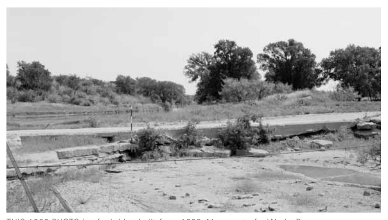
THIS 1989 PHOTO is of a bridge built from 1936-41 as part of a Works Progress Administration (WPA) project in Coleman County, Texas. Many Americans saw such projects as helpful, without considering their high cost and the corruption that plagued the program.

Crisis gripped the banking system when the new president assumed office on March 4, 1933. Roosevelt's action to close the banks and declare a nationwide