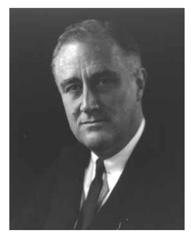
AMERICANS VOTED for Franklin Roosevelt in 1932 expecting him to adhere to the Democratic Party platform, which called for less government spending and regulation.

Officials in the administration and in Congress believed that raising trade barriers would force Americans to buy more goods made at home, which would