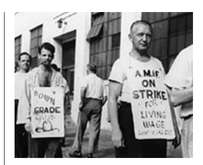
SPECIAL POWERS GRANTED to organized labor with the passage of the Wagner Act contributed to a wave of militant strikes and a "depression within a depression" in 1937.

Mencken excelled himself in attacking the triumphant FDR, whose whiff of fraudulent collectivism filled him with genuine disgust. He was the 'Fuhrer,' the 'Quack,' surrounded by 'an astonishing