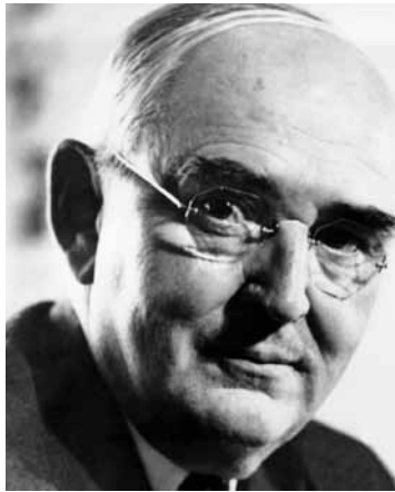
MICHIGAN SENATOR Arthur Vandenberg argued that a sound economy could not be restored through FDR’s punitive tax and regulatory measures.

Though he seized the country’s gold, Roosevelt did return booze to America’s bars and parlor rooms. On his second Sunday in the White House, he remarked at dinner, “I think this would be a good time for beer.” 23 That same night, he drafted a message asking Congress to end