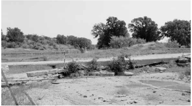
THIS 1989 PHOTO is of a bridge built from 1936-41 as part of a Works Progress Administration (WPA) project in Coleman County, Texas. Many Americans saw such projects as helpful, without considering their high cost and the corruption that plagued the program.

Crisis gripped the banking system when the new president assumed office on March 4, 1933. Roosevelt's action to close the banks and declare a nationwide