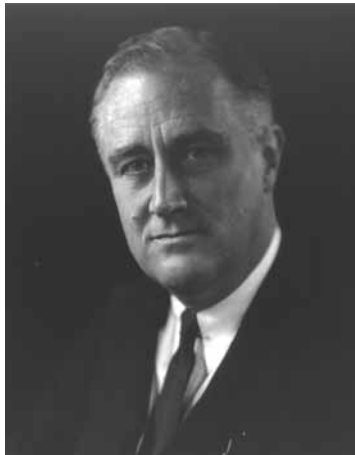
AMERICANS VOTED for Franklin Roosevelt in 1932 expecting him to adhere to the Democratic Party platform, which called for less government spending and regulation.

Officials in the administration and in Congress believed that raising trade barriers would force Americans to buy more goods made at home, which would