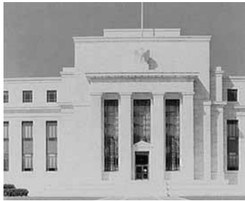
PEOPLE WHO ARGUE that the free-market economy collapsed of its own weight in the 1930s seem utterly unaware of the critical role played by the Federal Reserve System’s gross mismanagement of money and credit.

A common thread woven through all of those earlier debacles