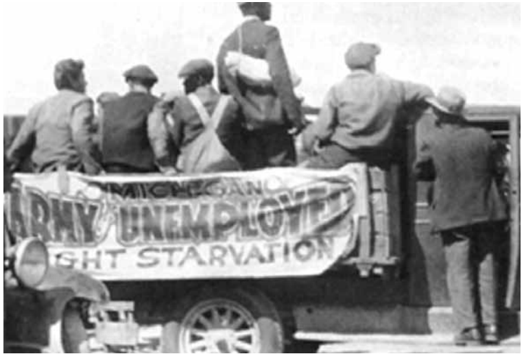
UNEMPLOYMENT SKYROCKETED after Congress raised tariffs and taxes in the early 1930s and stayed high as policies of the Roosevelt administration discouraged investment and recovery during the rest of the decade.

Substantial cuts in high marginal income tax rates in the Coolidge years certainly helped the economy and may have ameliorated the price effect of Fed policy. Tax reductions spurred investment and real economic growth, which in turn yielded a burst of technological advancement and entrepreneurial discoveries of cheaper ways to produce goods. This explosion in productivity undoubtedly helped to keep