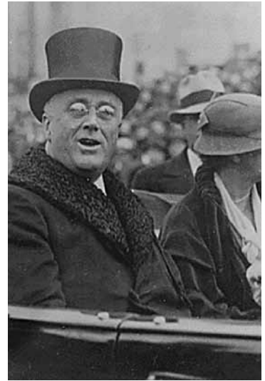
PRESIDENT FRANKLIN ROOSEVELT decried as selfish “economic royalists” those businessmen who opposed the burdensome taxes and regulations of his “New Deal.”

In September 1931, with the money supply tumbling and the economy reeling from the impact of Smoot-Hawley, the Fed imposed the biggest hike in its discount rate in history. Bank deposits fell 15 percent within four months and sizable, deflationary declines in the nation’s money supply persisted through the first half of 1932.