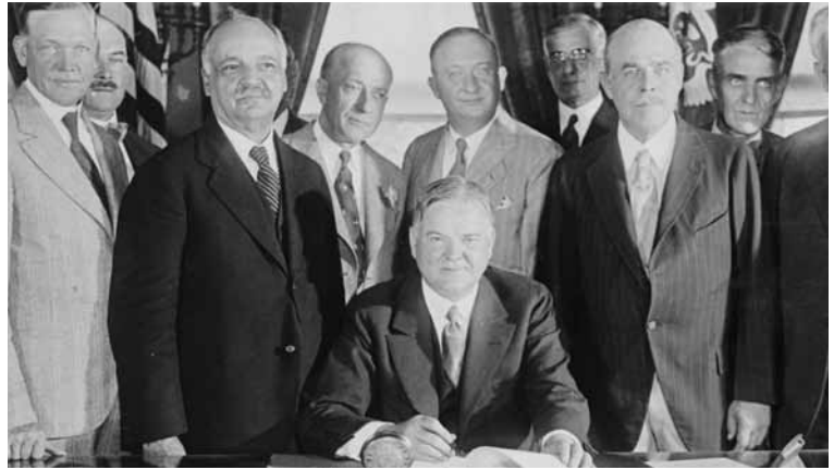
PRESIDENT HERBERT HOOVER is mistakenly presented in standard history texts as a laissez-faire president, but he signed into law so many costly and foolish bills that one of Franklin Roosevelt’s top aides later said that “practically the whole New Deal was extrapolated from programs that Hoover started.”

Did Hoover really subscribe to a “hands-off-the-economy,”